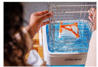
PVA Removal Station Remove water-soluble PVA support material up to 4X faster