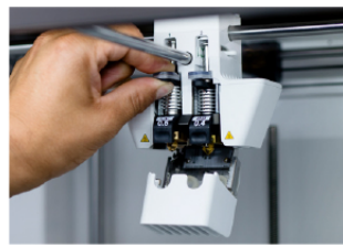
Print core CC Hardened steel nozzle for printing abrasive glass and carbon fiber composites. Available in 0.4 and 0.6 mm