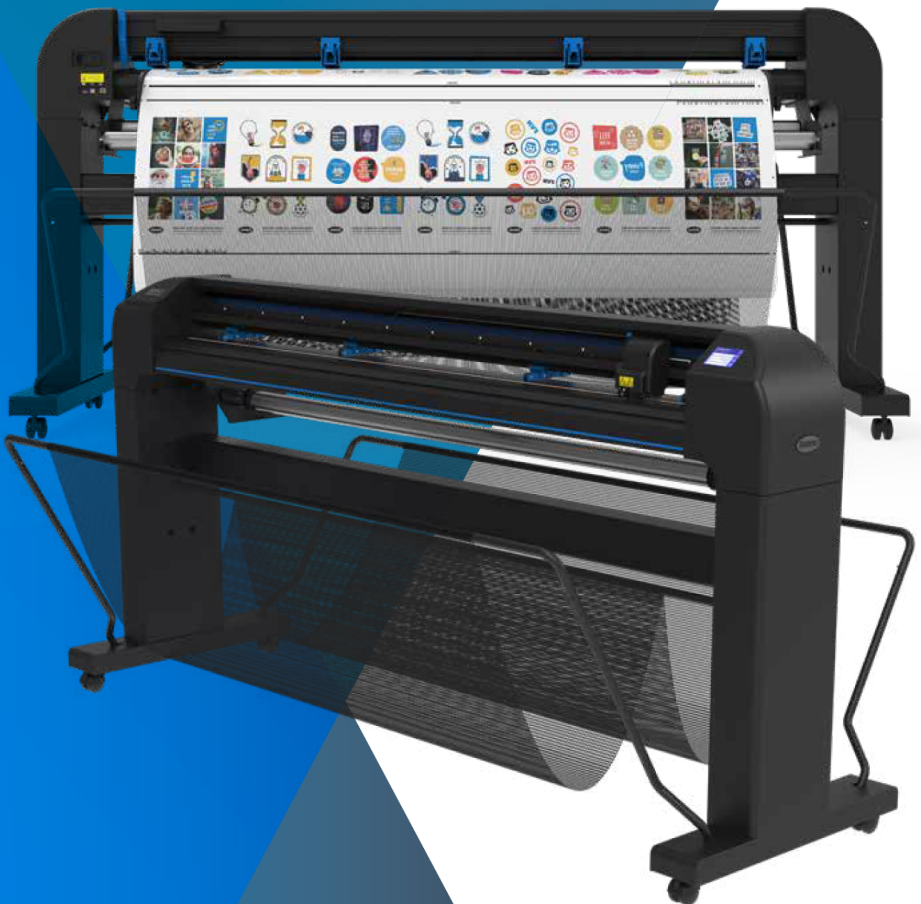
Summa S Class 3 Series

Leave nothing to chance and enjoy our leading-edge contour cut excellence!