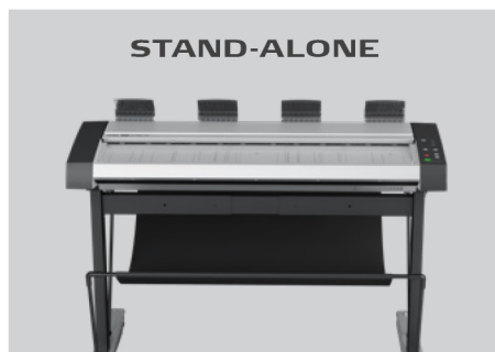
Operate your Nextimage software from a PC separate from the stand