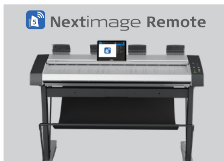
Remote control Nextimage software from your tablet