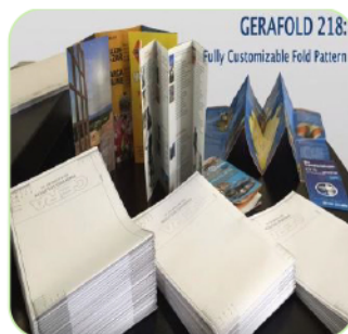
Full customization of folding