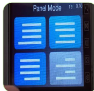
Selection of Panel Mode