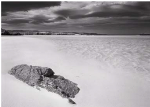
Uig Bay, Isle of Lewis, Outer Hebrides

Digigraphie by Epson enables artists, galleries and museums alike to maximise their opportunities within the world of fine art.