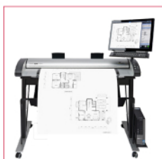
ScanStation Pro - IQ Quattro 4450 - IQ Quattro 4490