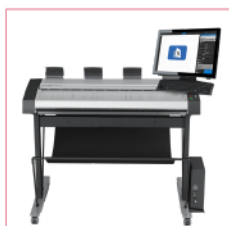
ScanStation Pro - HD Ultra X 6050 - HD Ultra X 6090