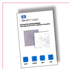
Includes Award-Winning Nextimage 5 REPRO software for scanning, copying and printing