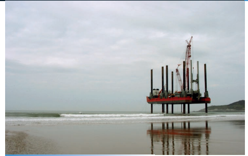
Oil & Mining Industries - Government Agencies