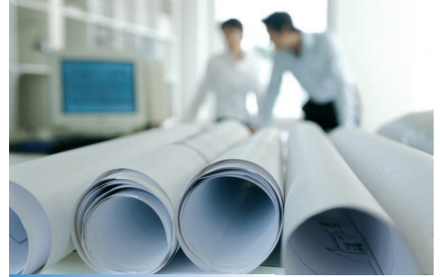
Architects - Engineers - Contractors