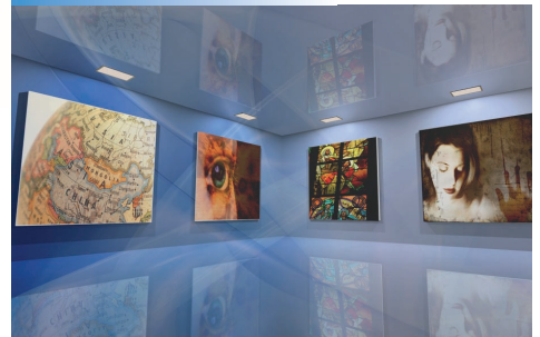
Copyshops - Reprographics